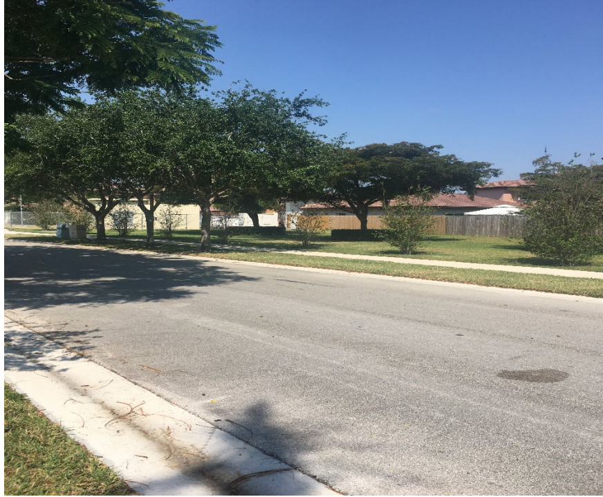
Park Tract "R" (facing west) – Well-maintained