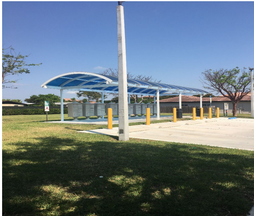
Park Tract "Q" (facing northwest) – Well-maintained