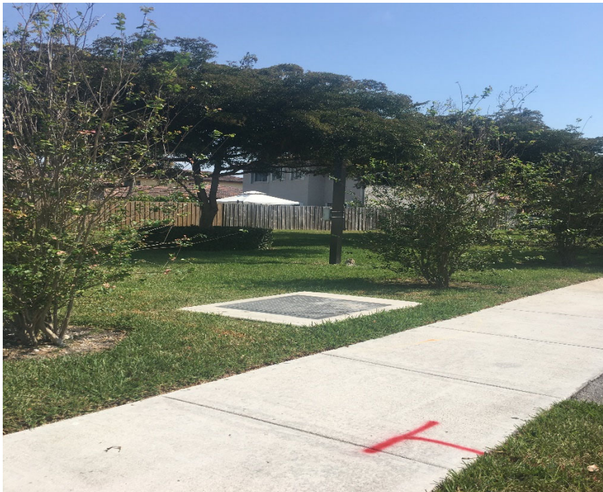
Park Tract "R" (facing east) – Well-maintained