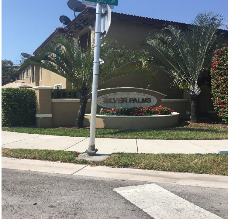
Entrance Feature Tract "N" (south of SW 230 th Terrace) – Well-maintained