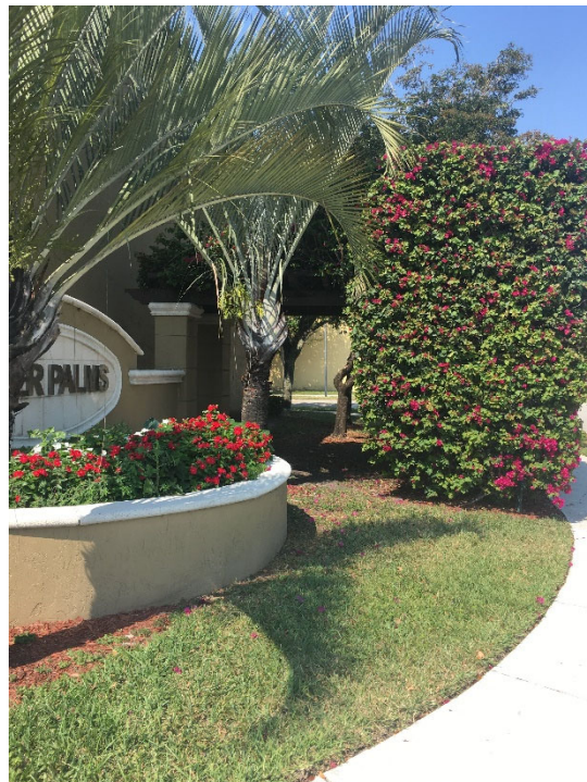
Entrance Feature Tract "N" (south of SW 230 th Terrace) – Well-maintained