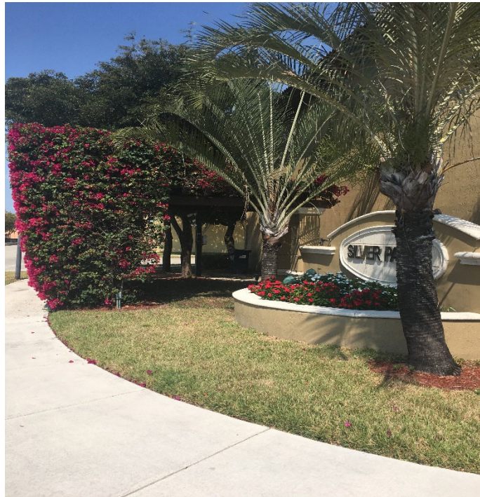
Entrance Feature Tract “A” (north of SW 230 th Terrace) – Well-maintained