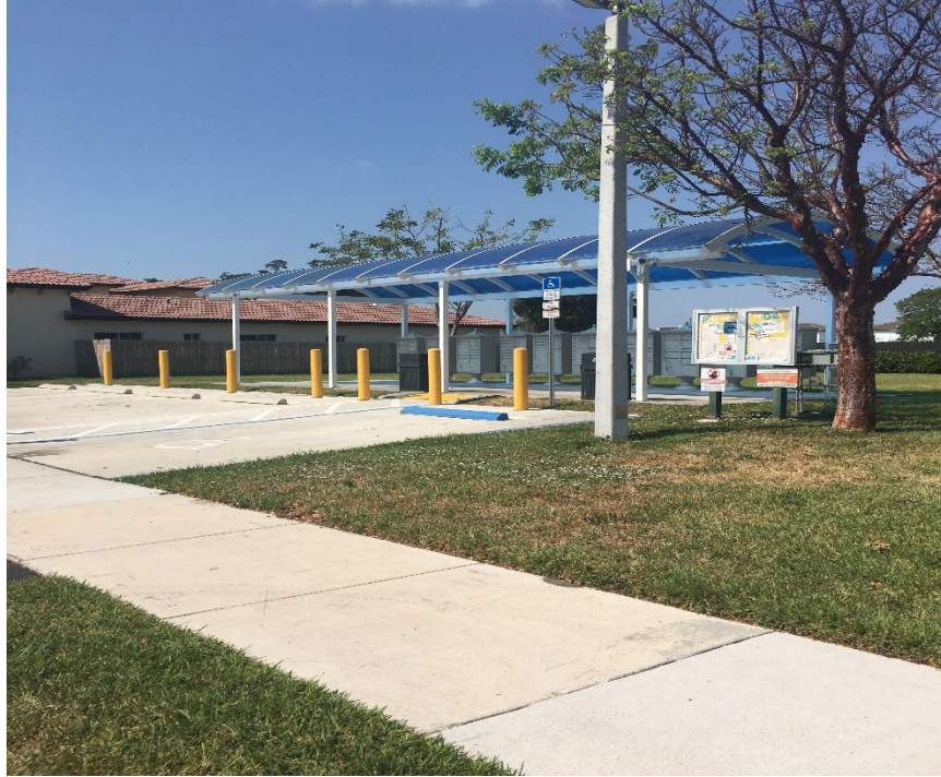
Park Tract "Q" (facing southwest) – Well-maintained