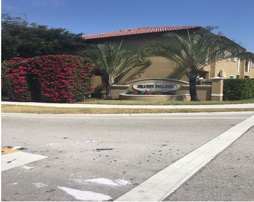
Entrance Feature Tract “A” (north of SW 230 th Terrace) – Well-maintained